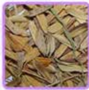
Husk / Immatured Grain