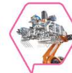
5-10kg Double Gripper