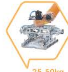
25-50kg Single Gripper