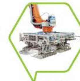
25-50kg Double Gripper