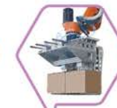
Carton Double Gripper