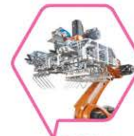
5-10kg Double Gripper