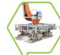
25-50kg Double Gripper