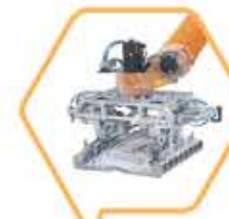
25-50kg Single Gripper