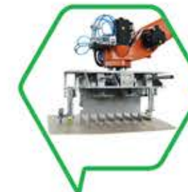
Vacuum Cardboard Gripper