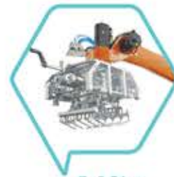
5-10kg Single Gripper