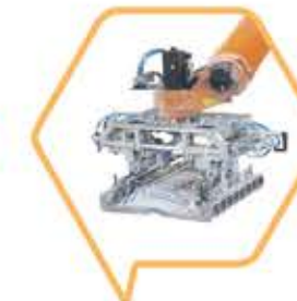
25-50kg Single Gripper