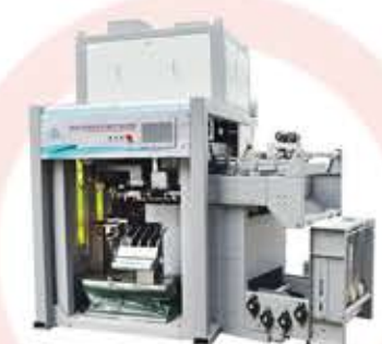
High Speed Rotary Packer 950 - 1100 bags/hr