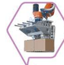
Carton Double Gripper