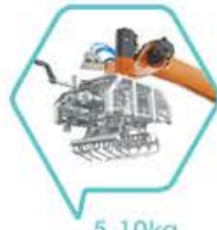
5-10kg Single Gripper

Gripper Available Now in IPMA INDUSTRY SDN BHD