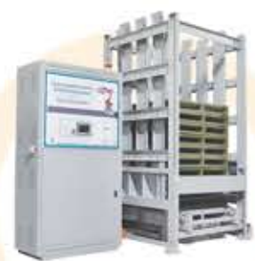
Pallet Dispenser (Store up to 15 pallets)