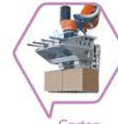
Carton Double Gripper