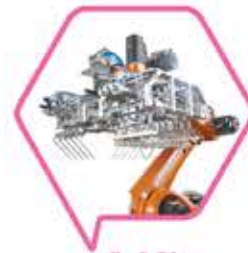
5-10kg Double Gripper