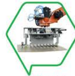
Vacuum Cardboard Gripper