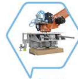
Carton Single Gripper