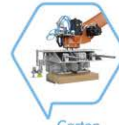
Carton Single Gripper