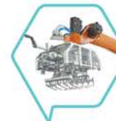
5-10kg Single Gripper

Gripper Available Now in IPMA INDUSTRY SDN BHD