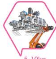
5-10kg Double Gripper