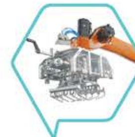
5-10kg Single Gripper