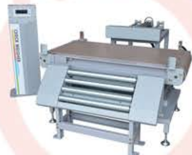
Check Weigher & Pneumatic Reject Mechanism