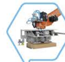
Carton Single Gripper