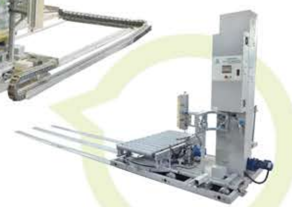
Transfer Cart Built-in Turntable Pallet Wrapper (Pallet Roller Conveyor)

Gripper Available Now in IPMA INDUSTRY SDN BHD