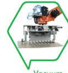
Vacuum Cardboard Gripper