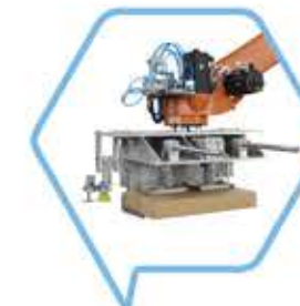
Carton Single Gripper