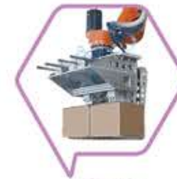
Carton Double Gripper