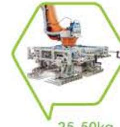
25-50kg Double Gripper