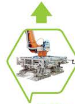
25-50kg Double Gripper