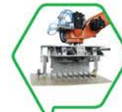
Vacuum Cardboard Gripper