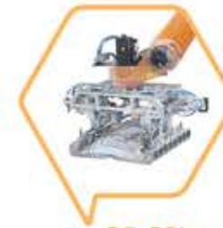
25-50kg Single Gripper