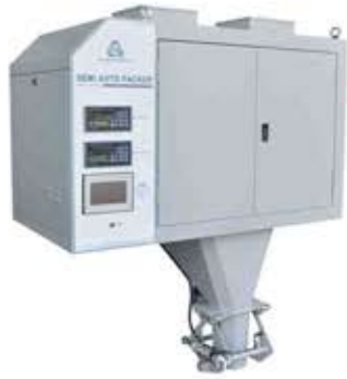
Semi Auto Packer (Twin Type) Model: SAP-50-2-CT