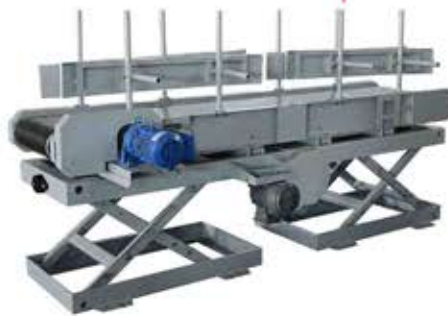
Heavy Duty Flat Belt Discharge Conveyor (with Motorize Scissor Lifting) Model : DC-H-400