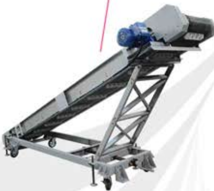
Inclined Flat Belt Discharge Conveyor (with manual adjustable stand) Model : DC-H-I-M-400