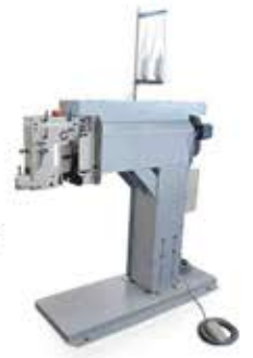
Model : DS-9C