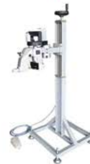
Model : NP-7A